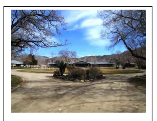
Deep Springs College