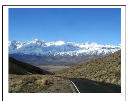
View towards Owens Valley from Hwy 168

College Entrance, 0.5 miles south of 168