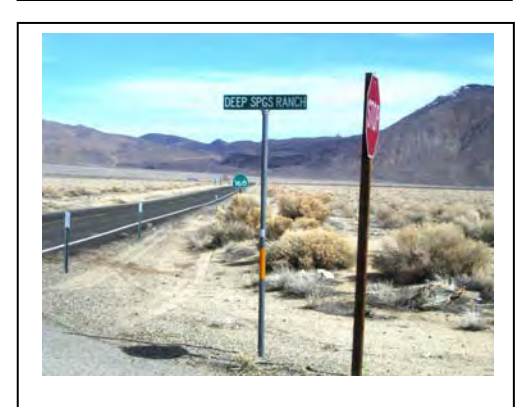
Road sign at road to college