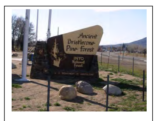
Sign on Highway 395 where, turn east on 168